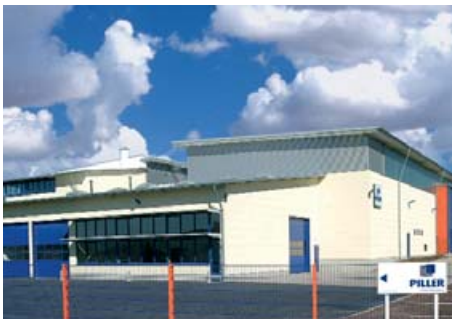
Assembly & Testing Facility, Bilshausen

Modern, purpose-built manufacturing facilities at Piller Osterode headquarters site in Germany, and purpose-built assembly and testing facility at nearby Bilshausen, extend to some fourteen hectares and approaching 50,000m 2 of accommodation. These facilities are absolutely state-of-the-art, and are widely regarded as the most comprehensive of their kind.