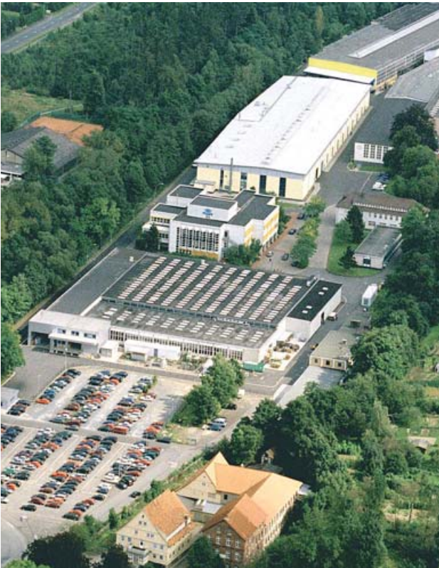
Piller Headquarters & Manufacturing Facility, Osterode