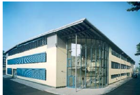
Manufacturing Facility, Osterode, Hall 5

'these facilities are widely regarded as the most comprehensive of their kind'