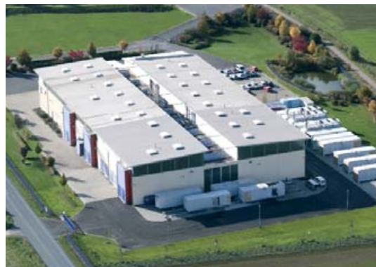
Assembly & Testing Facility, Bilshausen